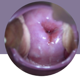
sidewall tissue encroachment